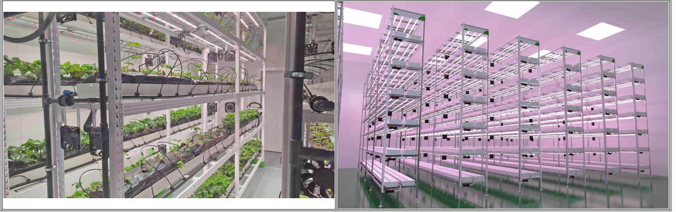
china plastic gutter for greenhouse hydroponic growing system