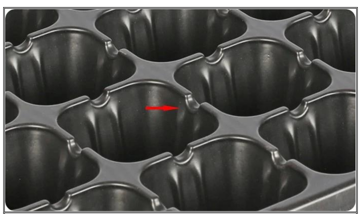
Root Guide Groove - The inner wall of the hole is conducive to the vertical growth of plant roots and prevents root entanglement