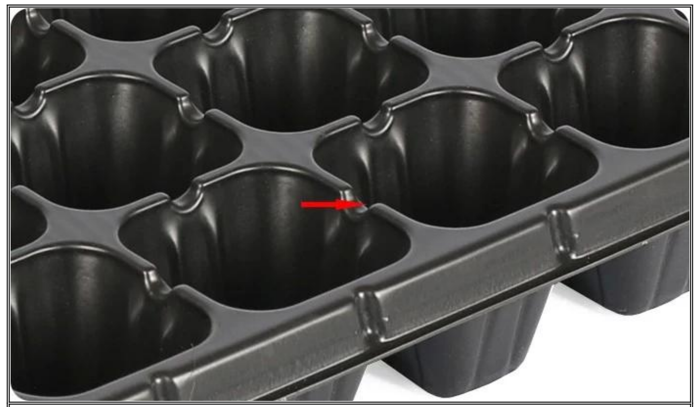
Overflow Groove - Keep the water balance in each cell and the plant grows neatly