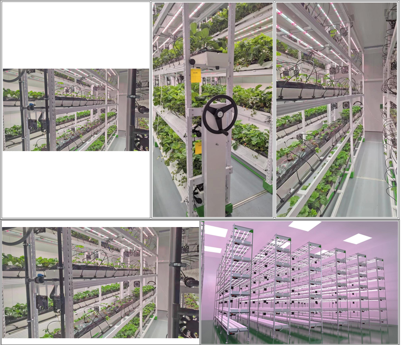
china hydroponic planting gutter for growing vegetables